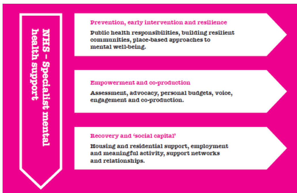
Figure 1: Rebalancing the system

A focus on prevention, early intervention and recovery is central to our approach, both as a way of improving the mental health and well-being of residents in Southend, Essex and Thurrock while ensuring the sustainability of the mental health system (see figure 1).