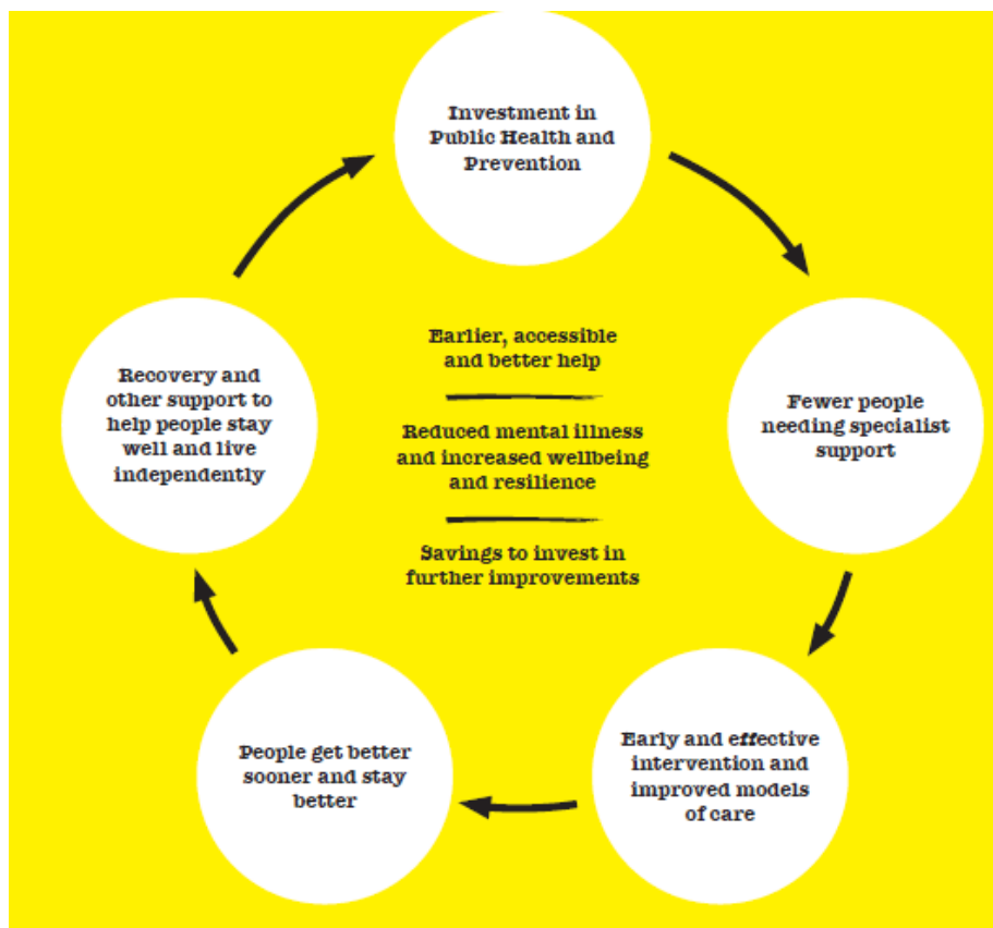
Figure 2: Better care drives system change and sustainability